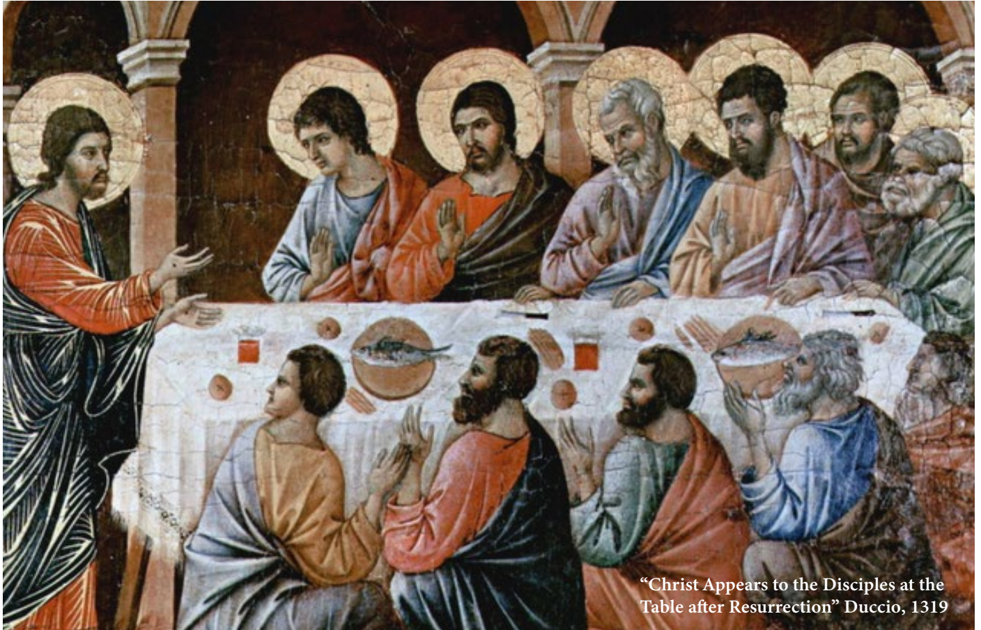
“Christ Appears to the Disciples at the Table after Resurrection” Duccio, 1319